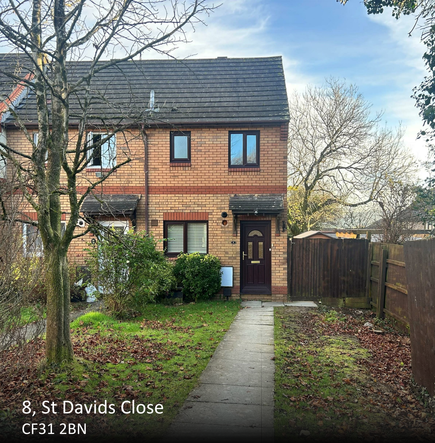
8, St Davids Close CF31 2BN